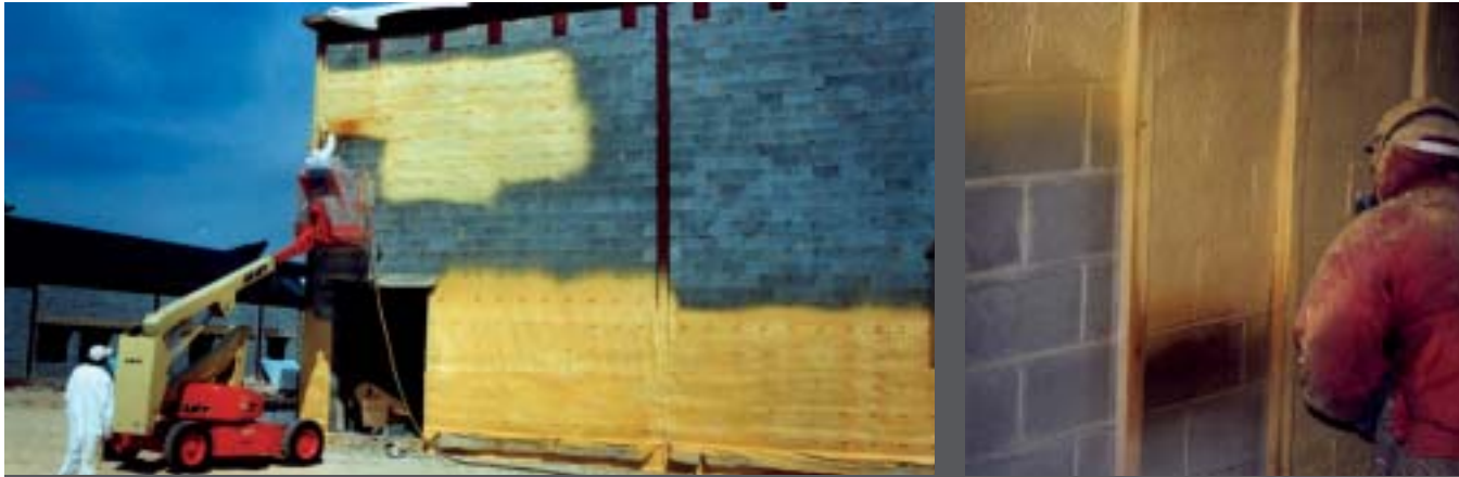
In the above curtain wall (CW) construction, 2-lb SPF is used to insulate the exterior of buildings, helping to eliminate thermal bridging, while adding a secondary barrier against water penetration to the inside of the building. On the right, 2-lb SPF is used to achieve high R-value in a limited space.